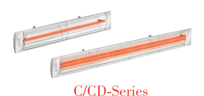
C-shaped body with 2.5" depth